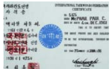
International Instructors Certificate

Appointed ITFNZ Chief Examiner and since this time conducted gup and dan gradings throughout New Zealand.