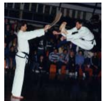
Black belt demo Pakuranga 1988