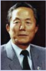
Gen. Choi Hong Hi