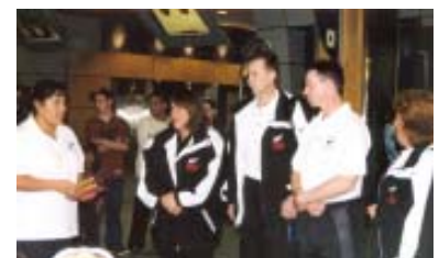
Italy World Champs Coaching Team