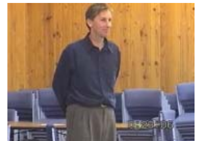
Seminar at the Instructors' Conference