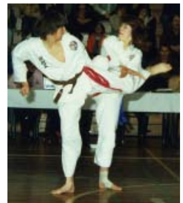
NZ National Tournament 20/8/78