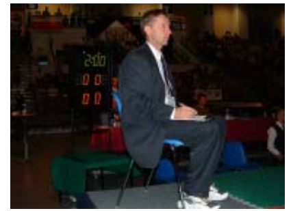
Judging the finals at the ITF World Champs in Poland