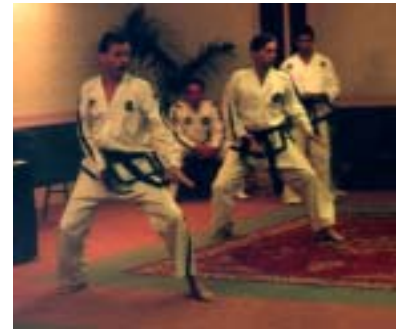
Maui Grading 1998