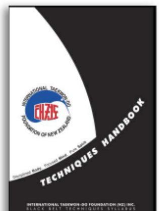
Black Belt Handbook