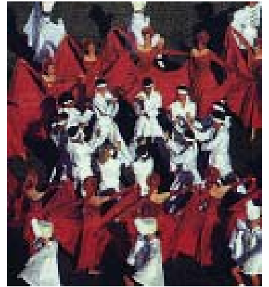
Commonwealth Games Opening