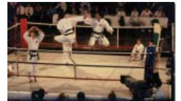
Sharp Tournament Demo Team 1985