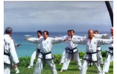
6th and 7th dan Class - Maui