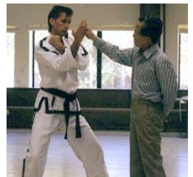
International instructors course, Colorado 1989

Conducted instructors courses throughout New Zealand.