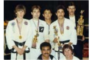
NZ Team - Fiji 1983