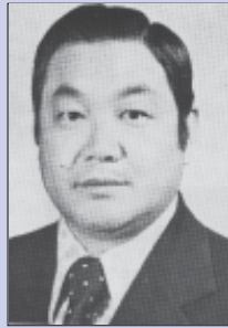
Master Nam Tae Hi