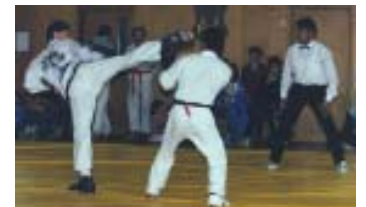
NZ Black belt champs 20/9/86